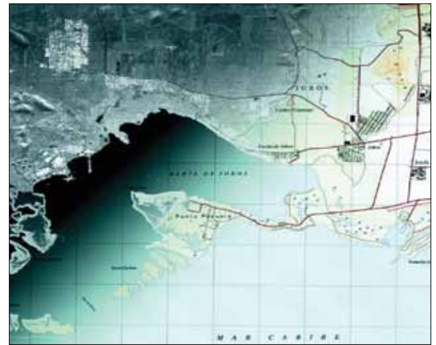
1:25K topographic map generation from IFSAR data – Puerto Rico.